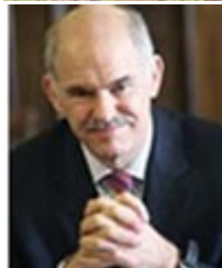
Papandreou A., George

President of Socialist International, President of PASOK