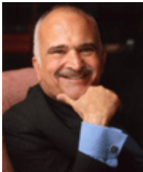
H.R.H. Prince El Hassan, Bin Talal